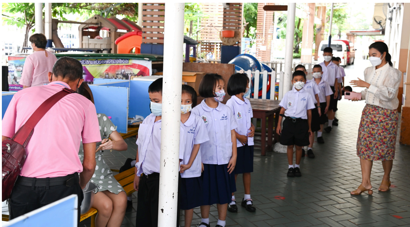
Wat Makut Kasatriyaram School, Bangkok