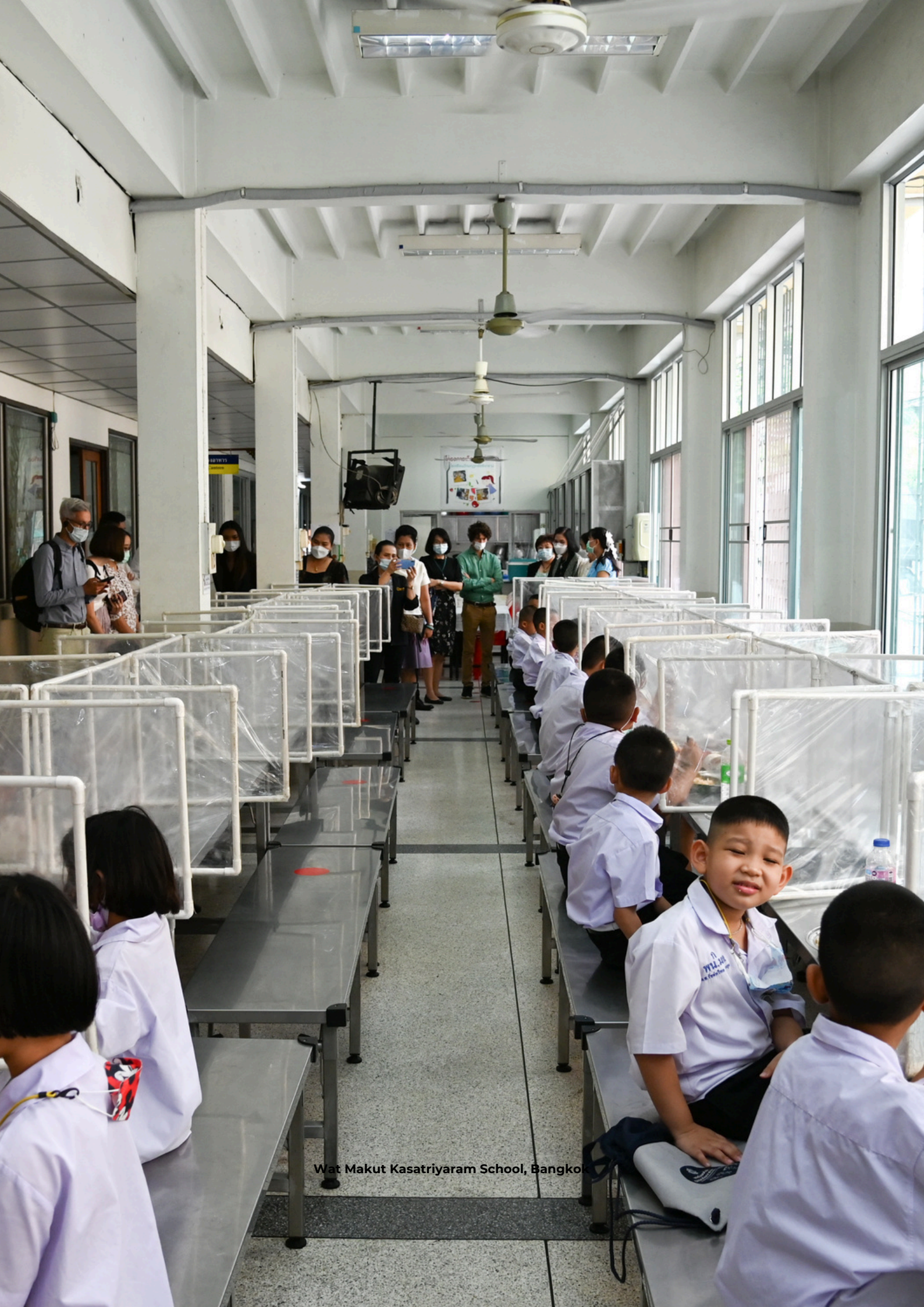
Wat Makut Kasatriyaram School, Bangkok